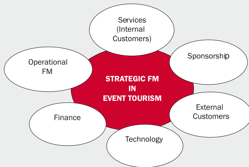
FIGURE 2. SFM Performance Measurement Constructs in Event Tourism